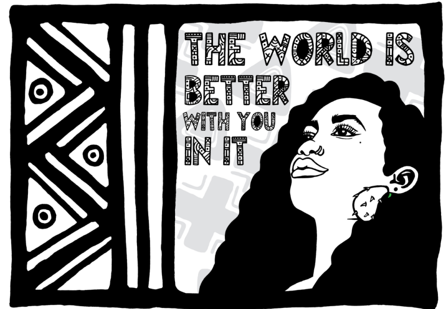
Esperanza (The world is better with you in it) by Melanie Cervantes