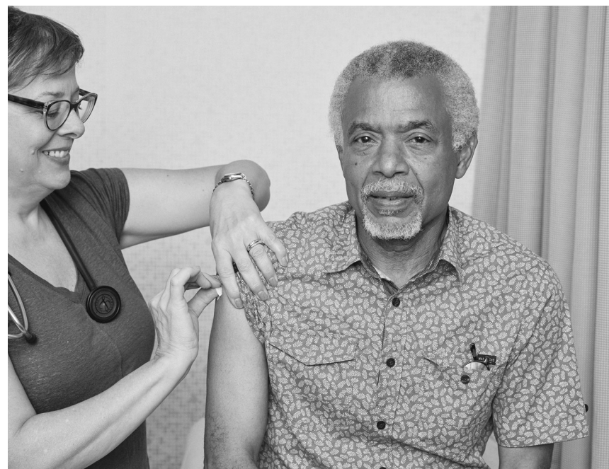
Prison Health News recommends getting vaccinated for COVID-19.