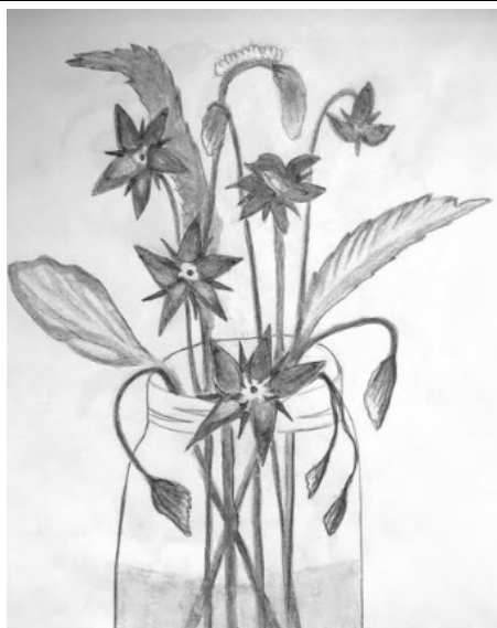
Caterpillar 1 by Joe Vanderford

Feeling anxious or jumpy throughout the day or even while unconscious is a symptom of hyper-awareness that can happen to sufferers of PTSD. Nightmares and stressful daydreams can signal an acute panic attack. You may experience flashbacks as replays of traumatic events. Intrusive, or unwanted, thoughts can