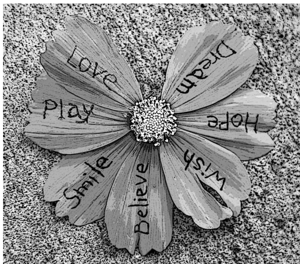
Life's Options by D Sharon Pruitt

Why does the prison system not pay for sexual reassignment surgery? This can be deemed a medical need, not much different from me needing to have orthoscopic surgery 18 months ago. These are very big mental